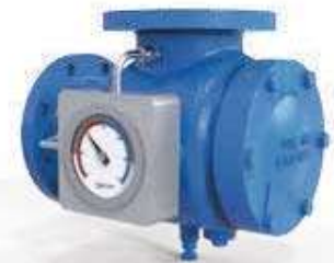
YSD-1, 2, 3R Type