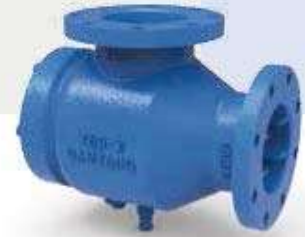
YSD-1, 2, 3 Type